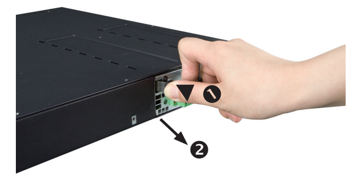
Figure 5-1 Removing the XGS3-PWR150-48